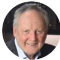
Michael Fullan Global Leadership Director